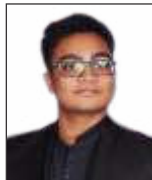
Kartavya K. IIT - Bombay BE - VIT